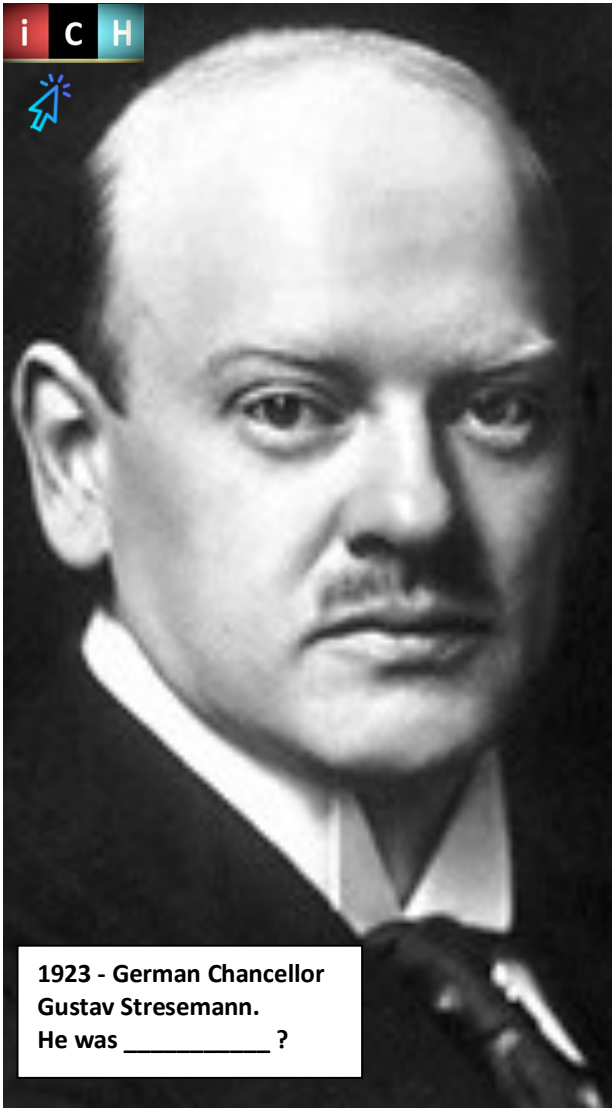
1923 - German Chancellor Gustav Stresemann. He was _____ ?

By 1923, it looked like Ebert and his SDP Party were d _____. The French take over of the R _____, the following h _____, the left-wing S _____ Revolt + finally the attack of the right-wing F _____ in the K _____ P _____ put increasing pressure on the Weimar Government. Yet, it would survive. In part, this was due to the new Chancellor, G _____ S _____. Note ... President Ebert died in 1925 + was replaced by General Hindenburg.